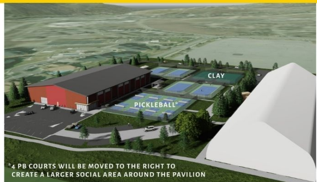
* 4 PB COURTS WILL BE MOVED TO THE RIGHT TO CREATE A LARGER SOCIAL AREA AROUND THE PAVILION