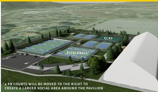
* 4 PB COURTS WILL BE MOVED TO THE RIGHT TO CREATE A LARGER SOCIAL AREA AROUND THE PAVILION